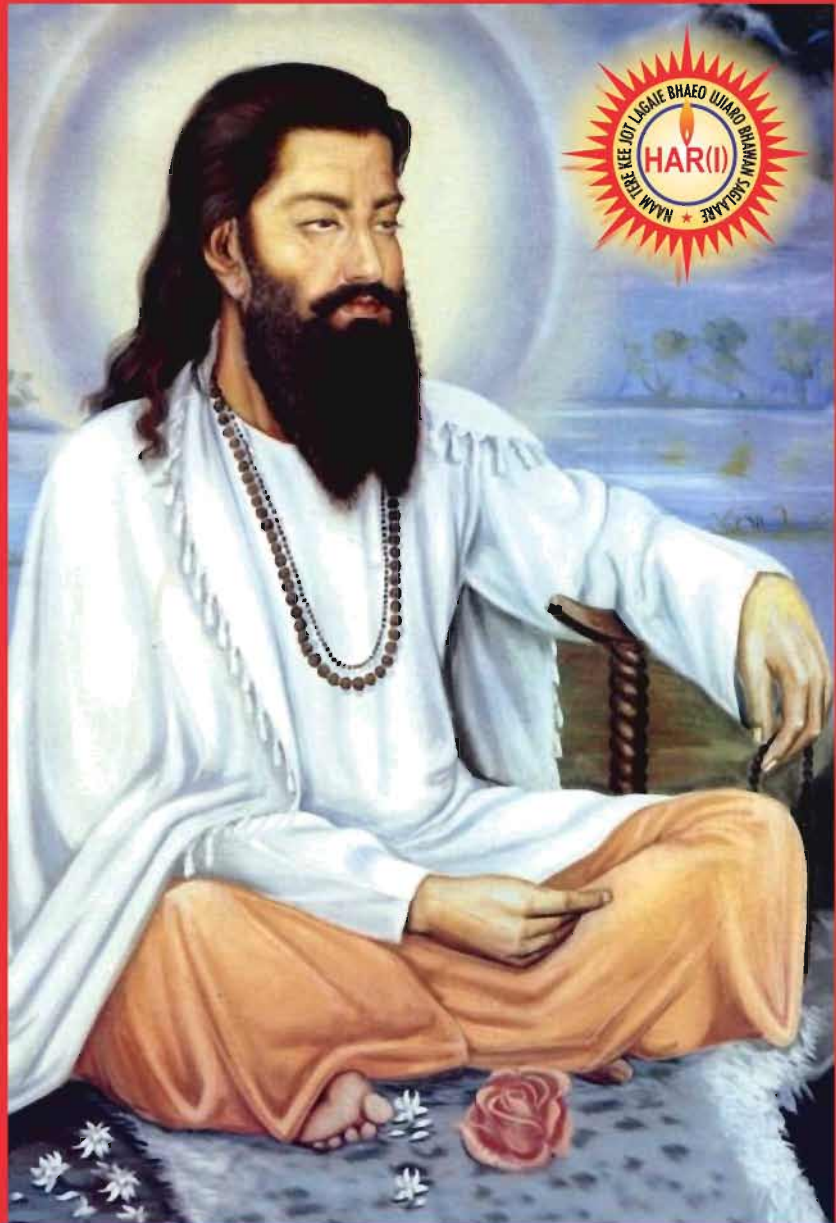
Jagatguru Ravidass Maharaj Ji