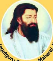
Jagatguru Ravidass Maharaj Ji